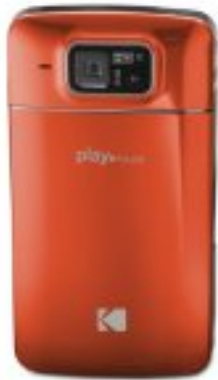
Pocket Cameras Kodak PlayTouch (I have, but it's already old) $100 +/-