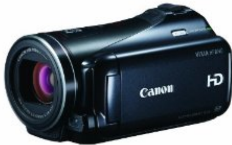
Mid-Range Cameras $300-$600