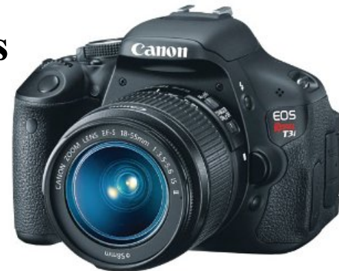
DSLRs $600 +